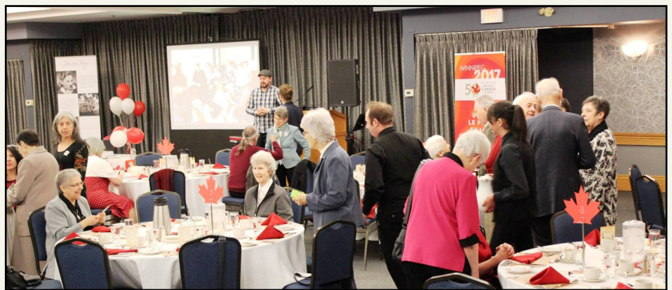
The 2017 Gabrielle Roy brunch took place on March 19 th at the Norwood Hotel.