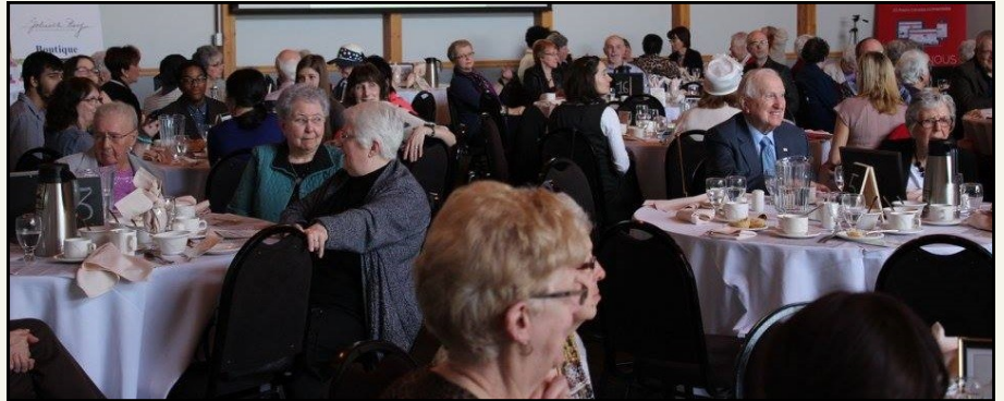
The 2016 Gabrielle-Roy Brunch was held at the St. Boniface Golf Club

$4,222: grant amount allocated by the Winnipeg Foundation to MGR for the production of the play La visite chez Mélina in English during the summer of 2017